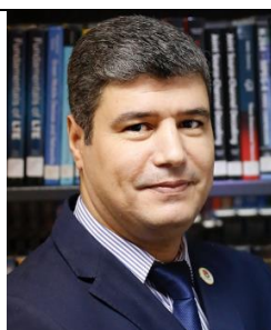
Assistant Professor (PI)